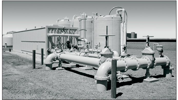
City of Avondale 2000 GPM Basin Water Nitrate Removal System

legal folks, and the purchasing/financing departments as to what you are trying to accomplish. You need to stress the facts that a well crafted lease provides the best hedge against any future wellhead treatment upsets.