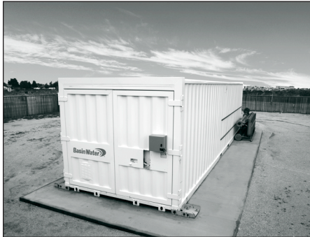
Baldy Mesa Water District 1000 GPM Basin Water Arsenic Removal System

be designed with a provision that provides a hedge against an untimely demise of the well, either due to a physical condition of the well or through migration of new pollutants that can't be removed by the existing treatment system. This type of provision is triggered if the well can no longer be used either due to a physical collapse of a well or a change in water quality